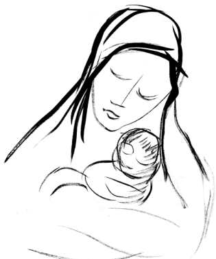
Drawing by Thomas Merton. Used with permission of the Merton Legacy Trust and the Thomas Merton Center at Bellarmine University.

Mother Seton House PO Box 673 Fryeburg, ME 04037